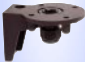
960 000 01 Wall bracket for machine tool tube fixing