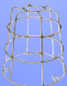
975 826 03 Protection cage