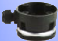
975 840 04 Surface Box IP 54 provided with joint allowing lateral access of connection cable and magnetic base